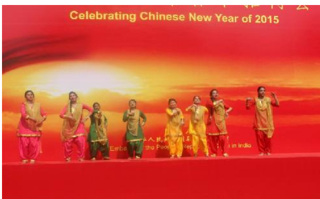
CCSEAS students performing an Indian Folkdance