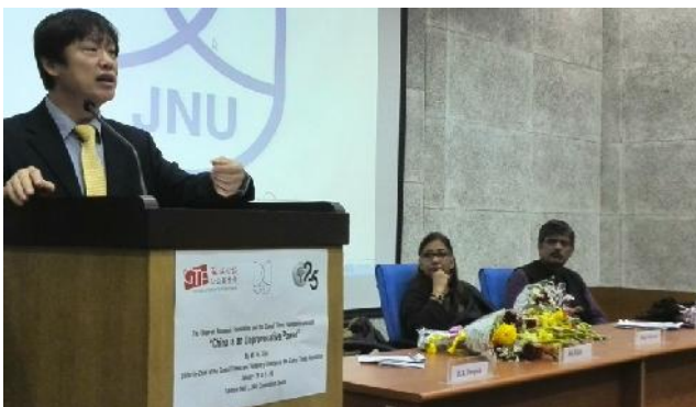
Hu Xijin during his speech